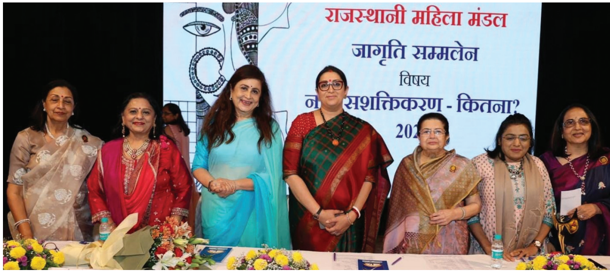
Various guests are seen on the stage of Jagriti Sammelan organised by Rajasthani Mahila Mandal in Mumbai on the occasion of International Women's Day.

(Standard Post Bureau) Mumbai, March 8 : On the occasion of International Women's Day, Rajasthani Mahila Mandal successfully organized Jagriti Sammelan in Mumbai. The theme of this conference was - "How much women empowerment."