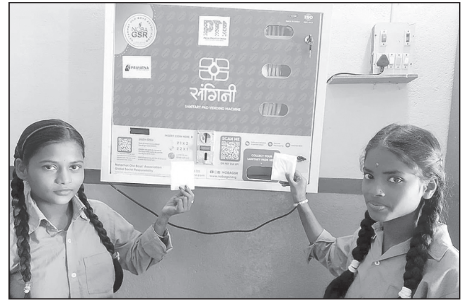
Two girls in front of a sanitary pad dispenser in Majhaul in Bihar's Begusarai.

At present, 11 Indian PSUs are in Mauritius, including Bank of Baroda, Life Insurance Corporation, New India Assurance Corporation, Telecommunications Consultant India Ltd, Indian Oil (Mauritius) Limited, Mahanagar Telephone (Mauritius) Ltd., State Bank of India (Mauritius), among others.