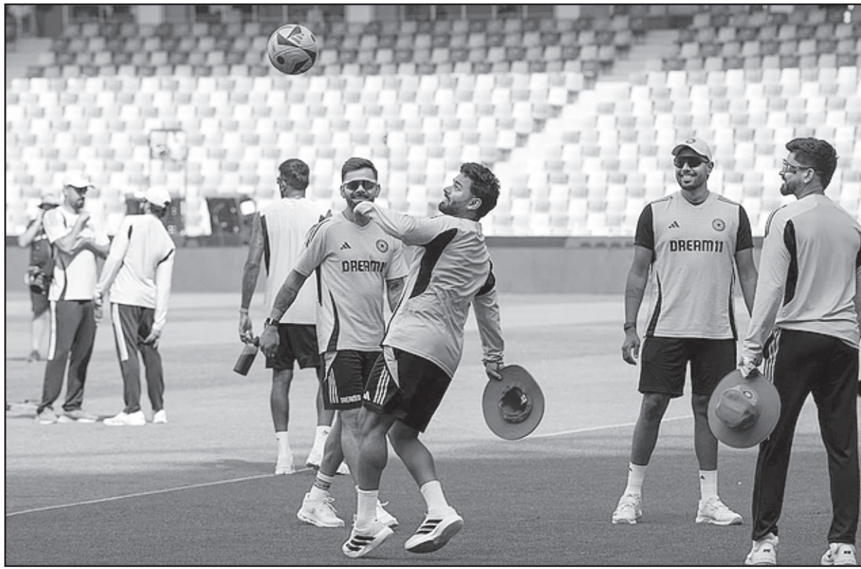
India's Virat Kohli, Rishabh Pant and other players during a practice session ahead of the ICC Champions Trophy 2025 final cricket match between India and New Zealand, in Dubai, UAE, Saturday.

"The boys will be ready for tomorrow, we've looked at a little bit more footage.