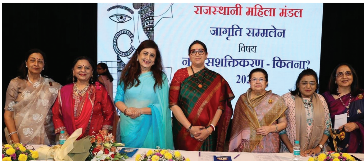
Various guests are seen on the stage of Jagriti Sammelan organised by Rajasthani Mahila Mandal in Mumbai on the occasion of International Women's Day.

(Standard Post Bureau) Mumbai, March 8 : On the occasion of International Women's Day, Rajasthani Mahila Mandal successfully organized Jagriti Sammelan in Mumbai. The theme of this conference was - "How much women empowerment."