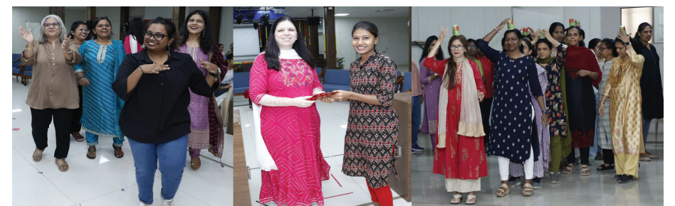
Women's Day Celebration at HQ office, Churchgate.