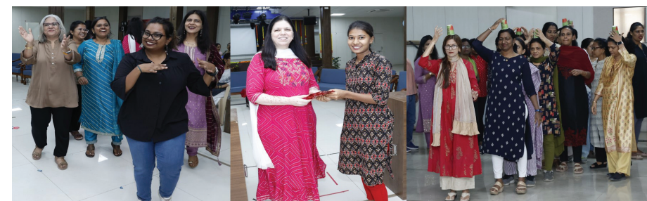
Women's Day Celebration at HQ office, Churchgate.