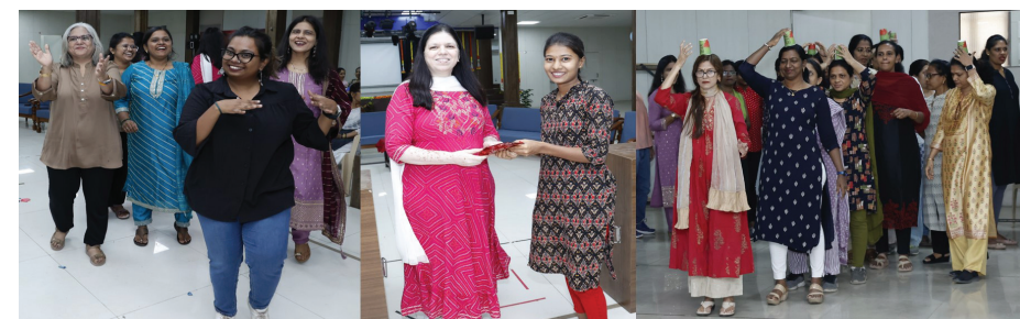
Women's Day Celebration at HQ office, Churchgate.