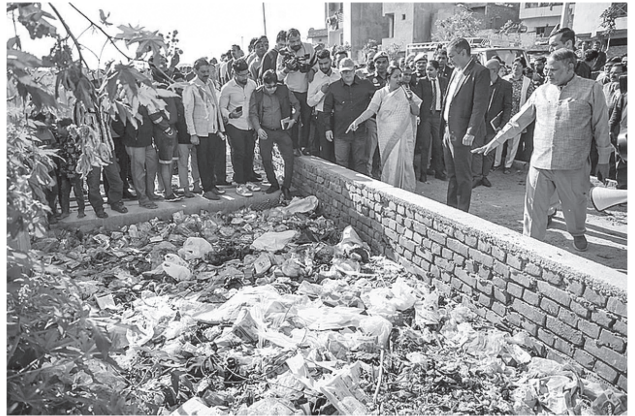
Delhi Chief Minister Rekha Gupta along with senior officials from PWD, DDA, MCD, DUSIB, and others during a visit at Ward-55, Shalimar Bagh, in New Delhi on Wednesday.

While such workshops and drills are crucial, their real impact lies in execution during emergencies. Experts argue that sustained follow-up action is needed beyond annual events. For meaningful change, local authorities must enforce building regulations, ensure regular evacuation drills, and make emergency kits accessible to residents. With the painful memories of the 1905 disaster still etched in the region's history, the state's ongoing preparedness efforts aim to ensure that a future earthquake does not bring the same level of devastation.