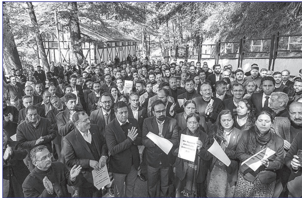
Lawyers stage a protest against the proposed Advocate Amendment Bill, in Shimla on Thursday.