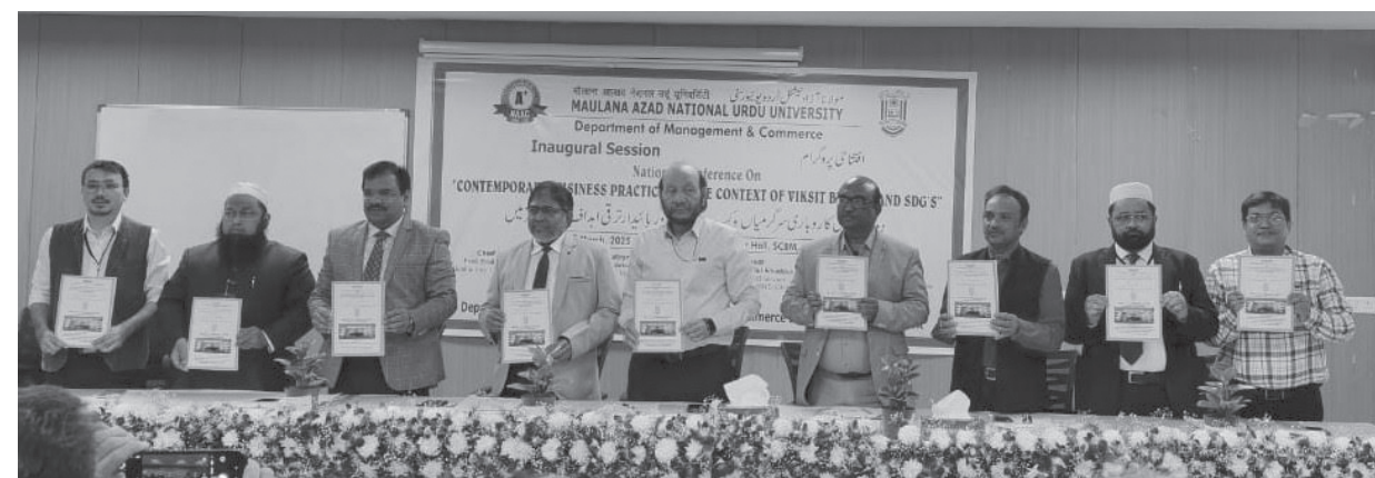
(Standard Post Bureau)

The two day national conference "Contemporary Business Practices in the Context of Viksit Bharat and SDGs" was inaugurated today at the Department of Management and Commerce, Maulana Azad National Urdu University (MANUU).