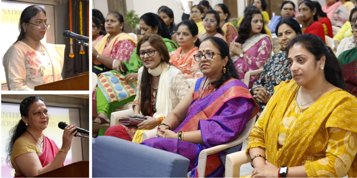
Women's Day Celebration at HQ office, Churchgate

(Standard Post Bureau) Mumbai, March 6 : Western Railway has commenced the celebrations for International Women's Day 2025 with a series of engaging and inspiring events aimed at honoring the contributions of women and fostering a spirit of inclusivity and empowerment at Headquarter as well as at all Divisions and Workshops of WR.