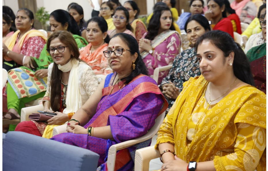
Women's Day Celebration at HQ office, Churchgate