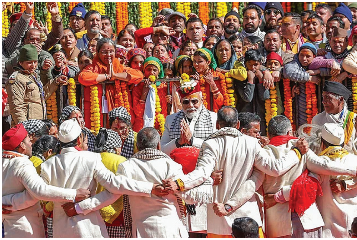
Prime Minister Narendra Modi being welcomed during a visit at Harsil, in Uttarkashi district on Wednesday.

Sensing something amiss, the police again checked the tempo thoroughly and found two cavities made at the bottom of the vehicle in which the IMFL was kept, he said. The police seized the liquor of different brands, collectively valued at Rs 19,70,120, the official said.