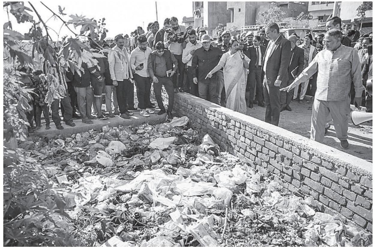
Delhi Chief Minister Rekha Gupta along with senior officials from PWD, DDA, MCD, DUSIB, and others during a visit at Ward-55, Shalimar Bagh, in New Delhi on Wednesday.