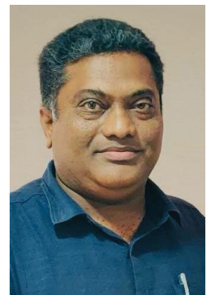
(By Ravi Kumar Boppana)

The Maha Kumbh 2025 in Prayagraj was an extraordinary spectacle of faith and devotion, bringing together an unprecedented 66.30 crore devotees to the sacred confluence of the Ganga, Yamuna, and the mythical Saraswati. Over 45 days, this grand spiritual gathering not only reinforced the deep cultural and religious heritage of India but also showcased an exceptional commitment to cleanliness and environmental responsibility.