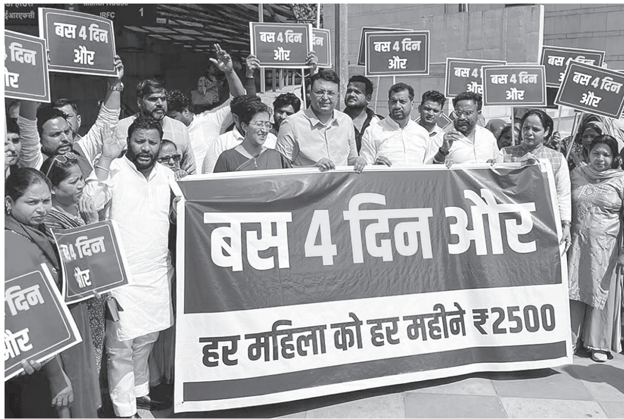
Delhi Assembly LoP Atishi and other AAP leaders protest demanding delivery of the first installment of Rs 2500 to women's accounts on March 8, the International Day for Women, in New Delhi on Tuesday.

He said before coming to power Congress leaders had promised to rectify the mistakes of the BRS government but after coming to power they forgot the promises.