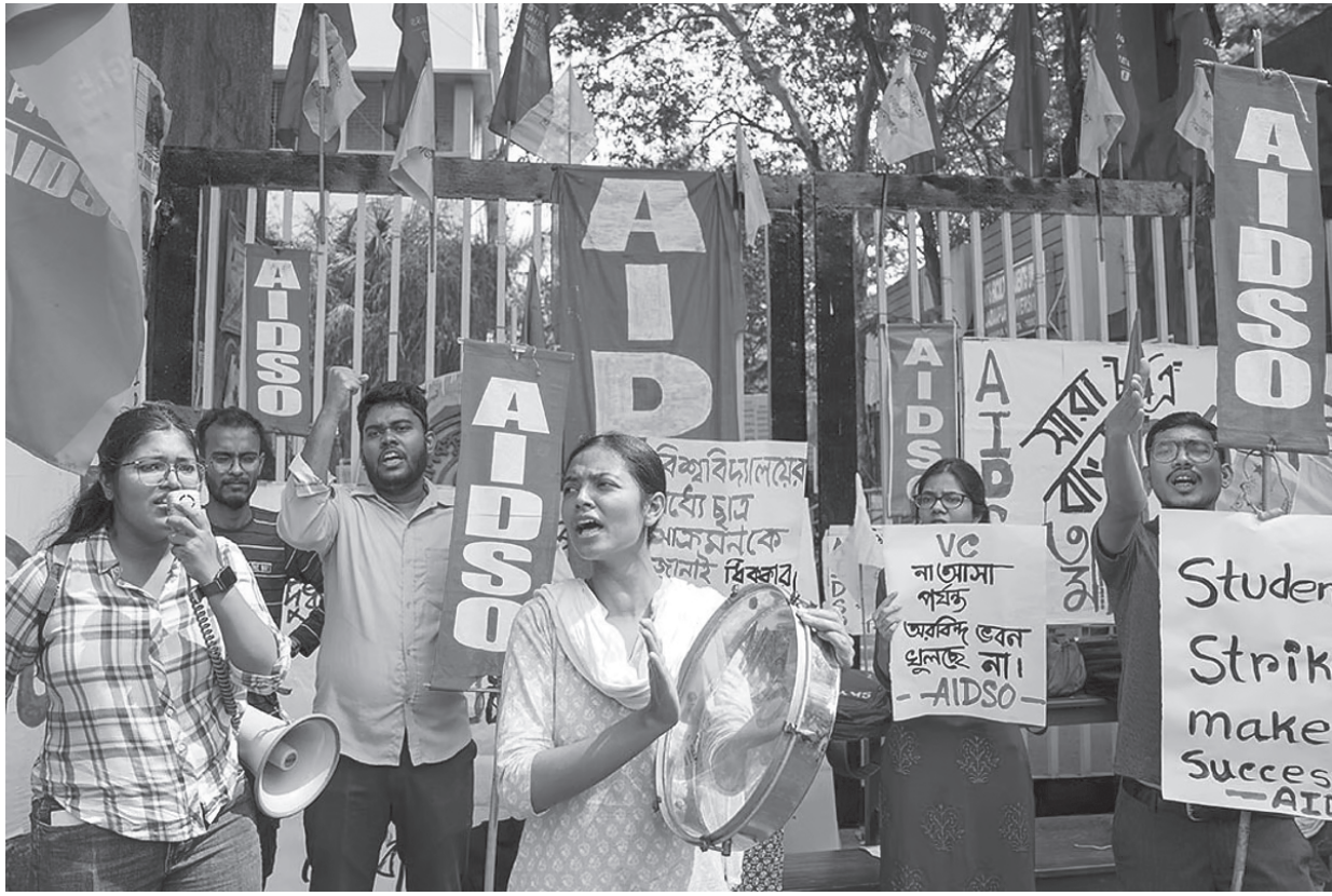
Members of All India Democratic Students' Organisation (AIDSO) during a strike demanding the resignation of Education Minister Bratya Basu, at Jadavpur University, in Kolkata. Two students were injured when a car in the convoy of Basu grazed past them during a melee in Jadavpur University on March 1.