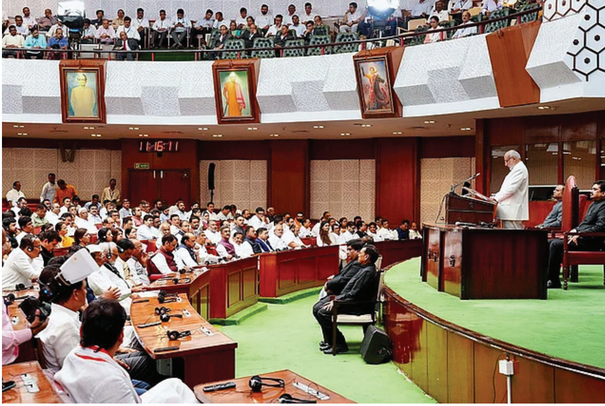
Maharashtra Governor CP Radhakrishnan addresses a joint session on the first day of the state Assembly's Budget session, in Mumbai.

The CDS will visit the Force Command Headquarters to gain insights into Australia's operational command structure and discuss potential avenues for joint operations. General Chauhan will also interact with the Australian Fleet Commander and the Joint Operations Commander. In furtherance of India's commitment to professional military training and education, the CDS is set to visit the prestigious Australian Defence College, where he will address senior officers on strategic challenges in the Indo-Pacific region.