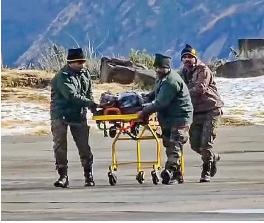
Injured people being evacuated to Joshimath for critical medicare via helicopters from the avalanche site, in Mana of Chamoli district, Uttarakhand on Saturday.