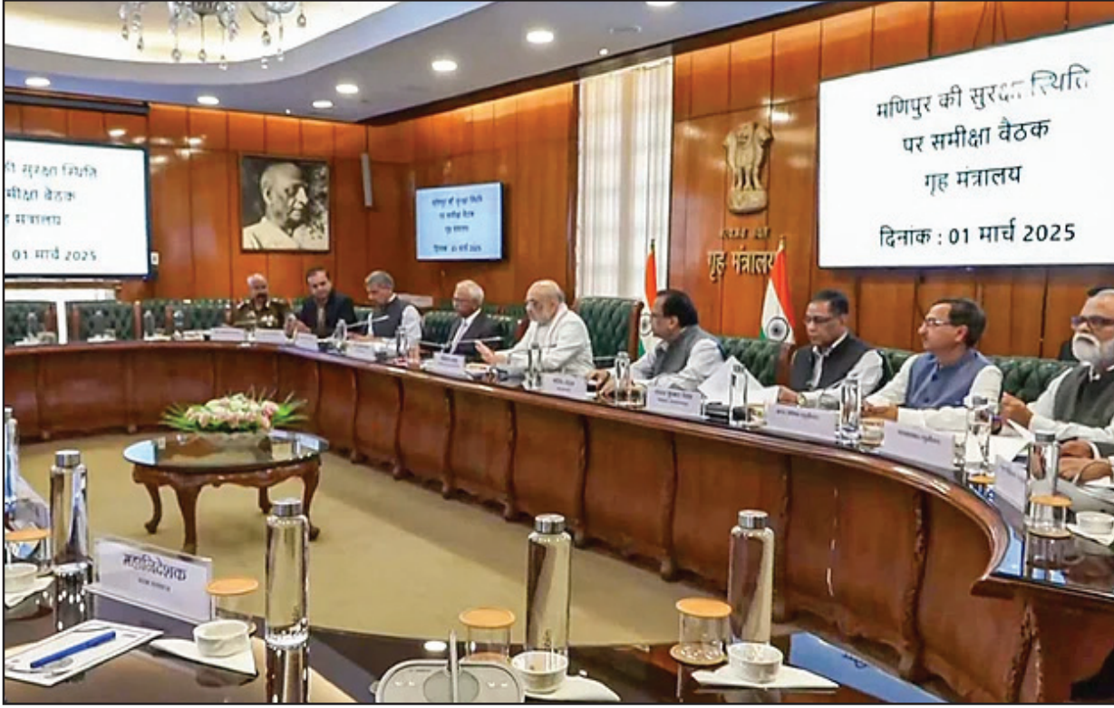
Union Home Minister Amit Shah chairs a meeting to review security situation in Manipur, in New Delhi.

The NIA and ATS sleuths visited the spot on Saturday, combed the estate and held a detailed probe, the sources added.