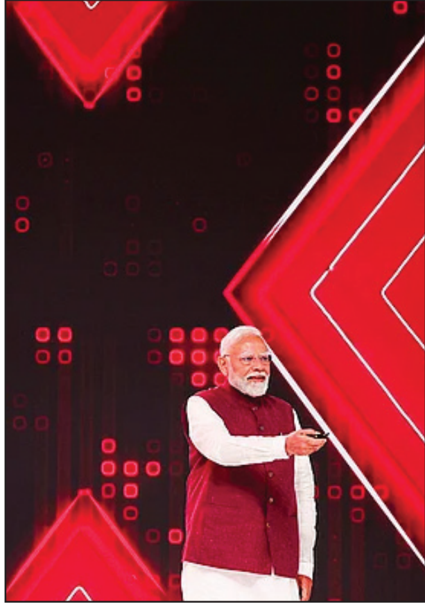
Prime Minister Narendra Modi addresses during the NXT Conclave, in Delhi on Saturday.

The exact cause of the fire is yet to be ascertained.