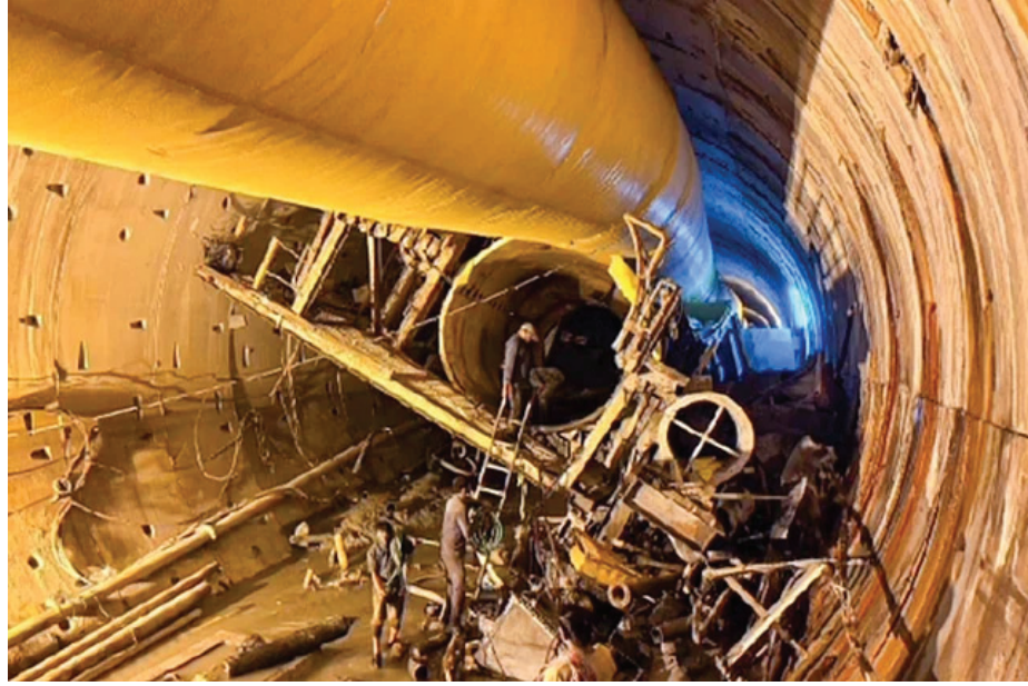
Rescue operation underway to trace workers trapped inside the partially collapsed Telangana's Srisailem Left Bank Canal tunnel, in Nagarkurnool on Saturday

Hyderabad, Mar 1 (UNI) : Chief Minister A Revanth Reddy on Saturday