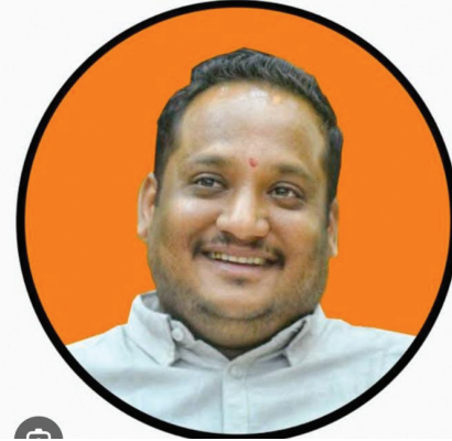
(Standard Post Bureau)

Mumbai, March 12 : The government has announced to provide 5 lakh new employment opportunities in the state.