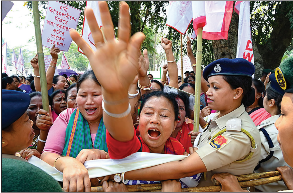
All India Democratic Women's Association members stage a protest, in Agartala, Tripura on Wednesday.