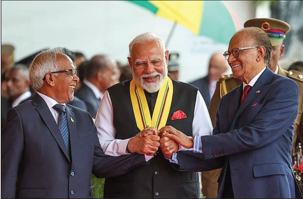
Prime Minister Narendra Modi after being conferred Mauritius's highest civilian award, the Grand Commander of the Order of the Star and Key of the Indian Ocean, by President of Mauritius Dharam Gokhool, at Port Louis in Mauritius.