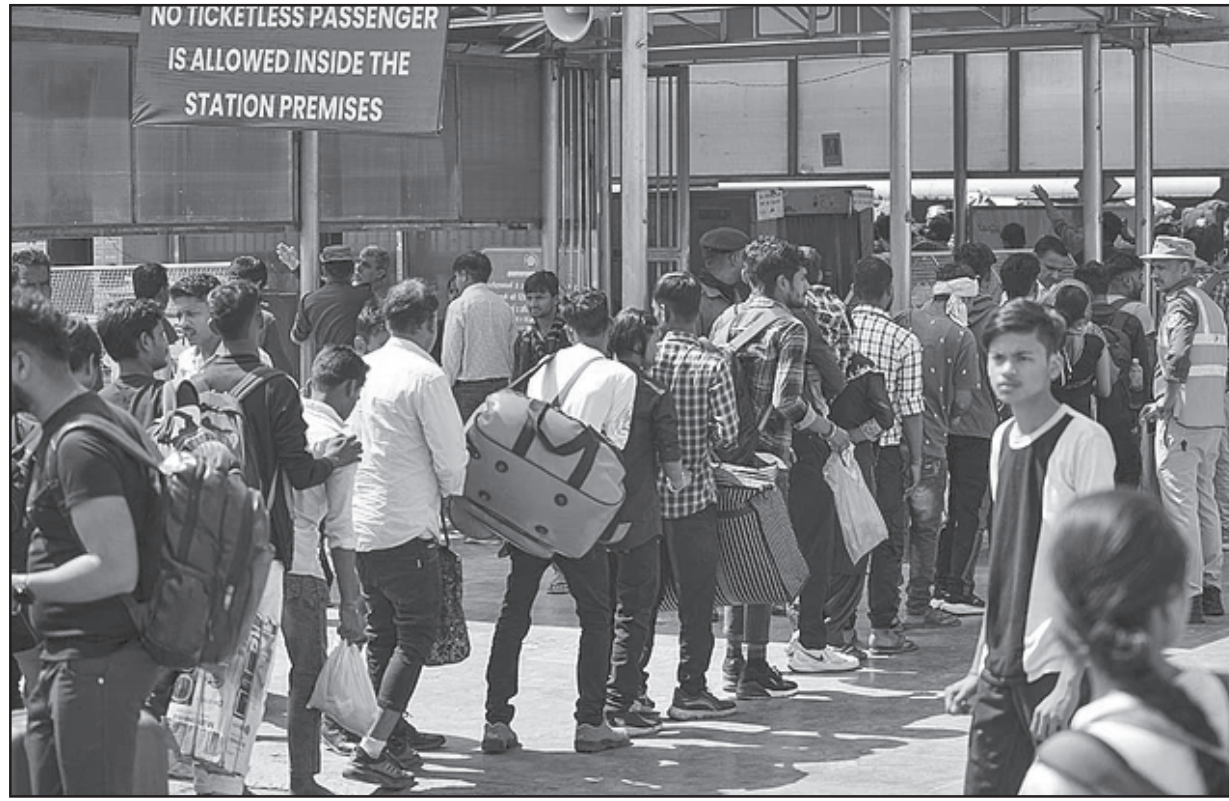
Passengers rush ahead of the Holi Festival at the New Delhi railway station, in New Delhi.

Official sources stated that more than 22,000 CRPs have undergone training to provide hands-on support to all Community Support Staff (CSS) for mobilization efforts aimed at creating more Lakhpati Didis in the state.