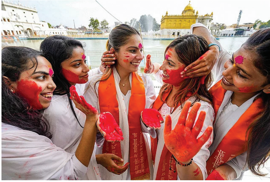
Young women celebrate Holi, at the Durgiana temple in Amritsar on Wednesday.

The SP chief said that law and order is in shambles under the BJP government. "Incidents of murder, robbery, rape, land grabbing are increasing continuously. Murders are happening every day in the state due to disputes. The situation is getting worse. Under the BJP government, land mafias are growing rapidly in every district," he claimed.