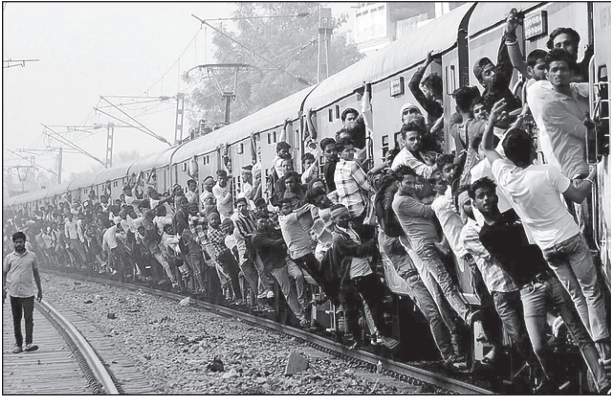
Passengers aboard an overcrowded train amid rush ahead of the Holi festival, in Patna.