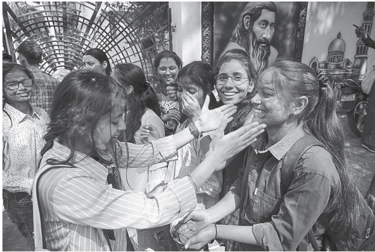
Students of Allahabad University apply 'gulaal' to each other ahead of Holi festival, in Prayagraj.

Asserting that the AAP government worked overtime to force a clash amongst Sikh groups, he said "this was the reason why the Shiromani Gurdwara Parbandhak Committee took a decision to install the new Jathedar in the early hours today at Sri Kesgarh Sahib".