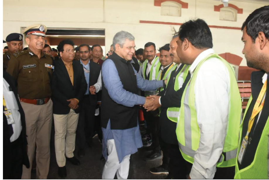
(Standard Post Bureau)

Railway Minister, Mr Ashwini Vaishnaw, undertook a morning visit to Prayagraj to personally review Indian Railways' extensive preparations for Mahakumbh 2025. Recognising the scale and significance of this grand religious gathering, he visited various stations under North Central Railway (NCR), North Eastern Railway (NER), and Northern Railway (NR) to assess on-ground operations. During his visit, he interacted with railway personnel, inspected key arrangements, and ensured that all systems were functioning smoothly to accommodate the unprecedented influx of devotees. Shri Vaishnaw also lauded the seamless coordination between different departments and reaffirmed Indian Railways' commitment to facilitating safe, efficient, and comfortable travel for all pilgrims. Railway Minister thanked Hon'ble Prime Minister for his continuous guidance and also thanked Hon'ble Home Minister Shri Amit Shah, Chief Minister of Uttar Pradesh Shri Yogi Adityanath, Chief Minister of Madhya Pradesh Shri Mohan Yadav, and the governments of neighboring states for their unwavering cooperation in handling the massive influx of pilgrims.