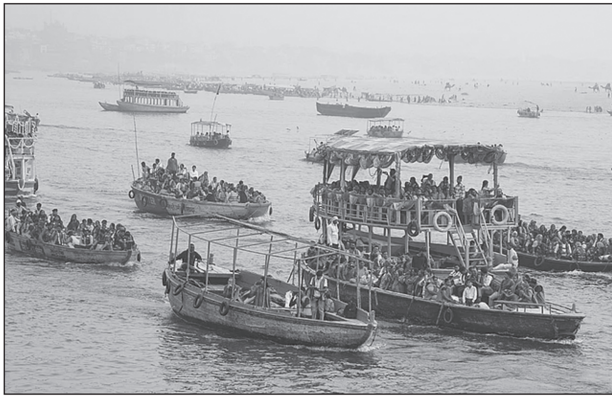
Devotees take a boat ride on Ganga river on the occasion of Maha Shivratri, in Varanasi on Wednesday.

Parking was constructed in 1,850 hectares, while 31 pontoon bridges, more than 67,000 street lights, 1.5 lakh toilets and 25,000 public accommodations were ensured. More than Rs 7,000 crore were spent by the Yogi government, while with the help of the central government, the entire Prayagraj was transformed with a total of Rs 15,000 crore. While more than 66 crore devotees gathered in 45 days, the maximum number was on Amrit Snan