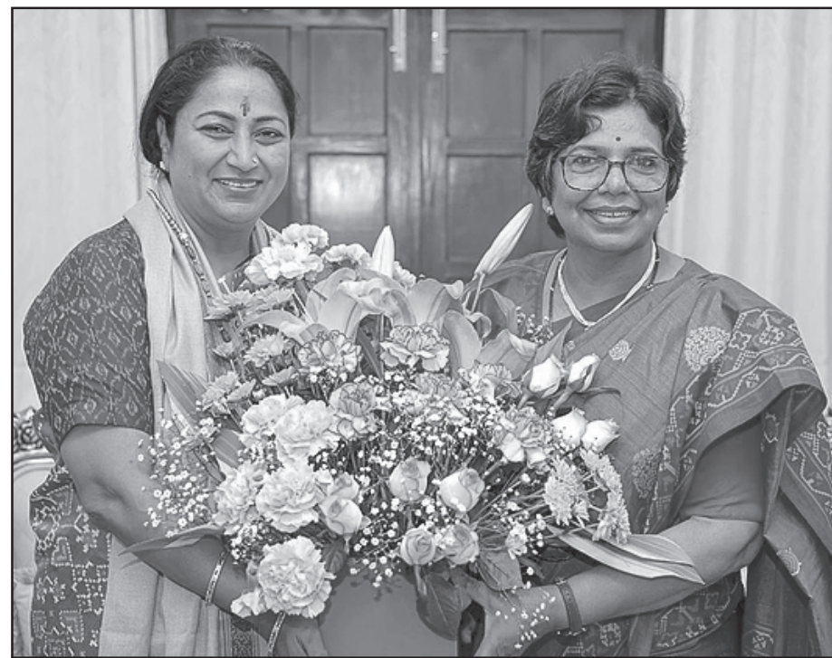
Delhi Chief Minister Rekha Gupta with National Commission for Women chief Vijaya Rahatkar during a meeting, in New Delhi on Wednesday.