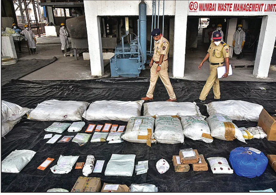
Navi Mumbai Police personnel during destruction of drugs seized from various parts of Navi Mumbai, at Talaja, in Navi Mumbai on Wednesday.

The ACADA system is used to detect Chemical Warfare Agents (CWA) and programmed Toxic Industrial Chemicals (TICs) by sampling the air from the environment.