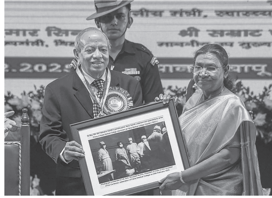
President Droupadi Murmu during the centenary celebration of Patna Medical College and Hospital, in Patna on Tuesday.

Congratulating the personnel after conferring gallantry, distinguished service, and meritorious service medals during the 18th ICG Investiture Ceremony here, Rajnath asserted that the vision of a secure and prosperous India can only be realised if its security system is robust and the forces are strong. He said that the ICG