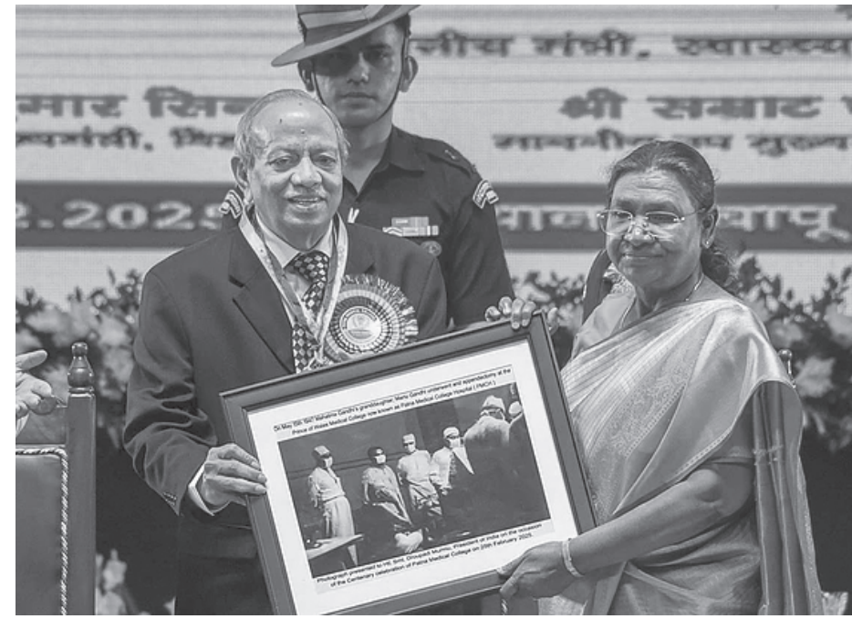
President Droupadi Murmu during the centenary celebration of Patna Medical College and Hospital, in Patna on Tuesday.

Congratulating the personnel after conferring gallantry, distinguished service, and meritorious service medals during the 18th ICG Investiture Ceremony here, Rajnath asserted that the vision of a secure and prosperous India can only be realised if its security system is robust and the forces are strong. He said that the ICG