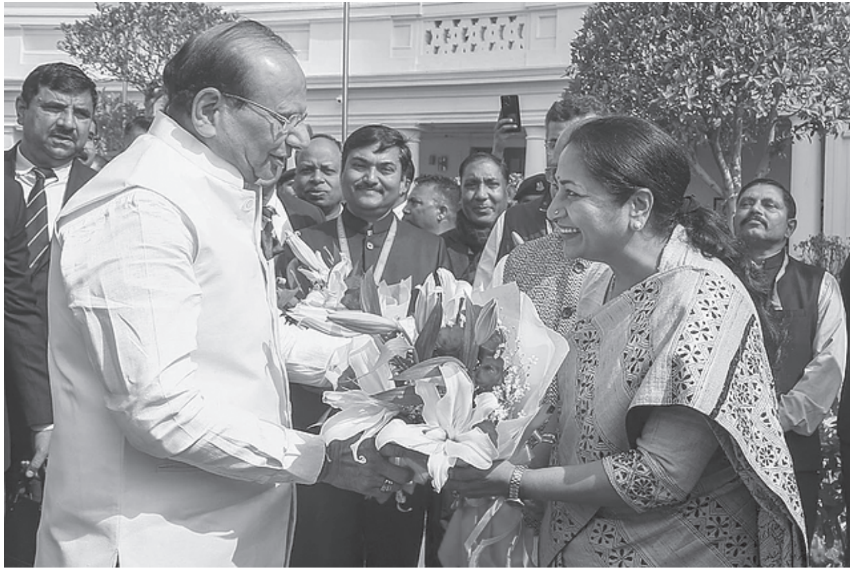
Delhi LG VK Saxena being welcomed by Delhi CM Rekha Gupta on his arrival for his address to the Delhi Assembly during its first session, in New Delhi on Tuesday.

In a step to facilitate more convenience for unreserved passengers, booking of paperless tickets has been enabled to all the destinations across Indian Railways, the SCR said in a release here on Tuesday. The UTS app is a big leap in the modern ticketing system and a boon to the huge segment of passengers on Indian Railways who travel on unreserved tickets.