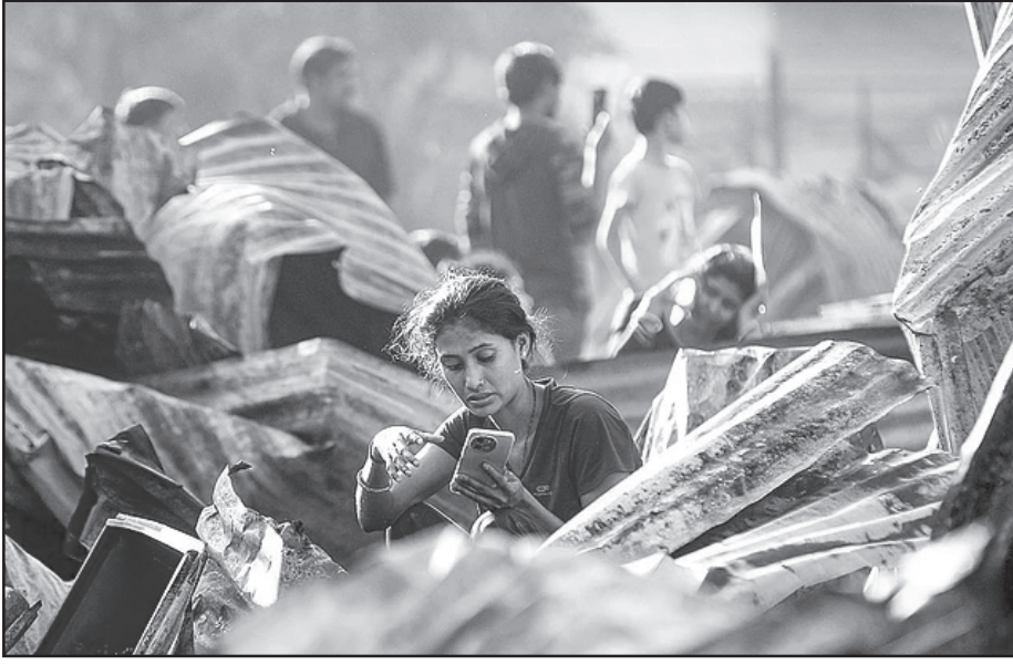
A woman looks for her belongings in the charred remains after a fire broke out in the huts near the gate of the iconic Film City on Thursday, in Mumbai's Goregaon area.