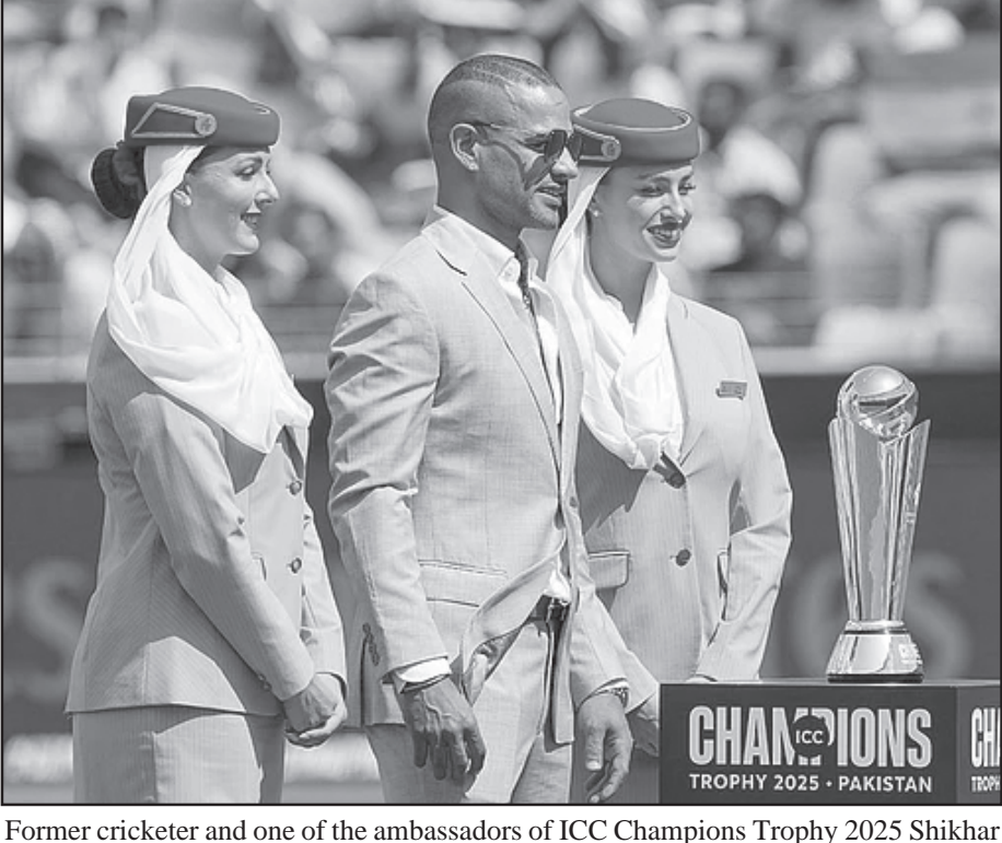
Dhawan before the start of the One Day International (ODI) cricket match of the tournament, between India and Bangladesh, in Dubai, UAE.

It was a chastening experience for Guardiola, whose discomfort was particularly relished by Real's fans because of his old Barcelona allegiances, as he faces a mammoth task to rebuild and restore City to Europe's top table.