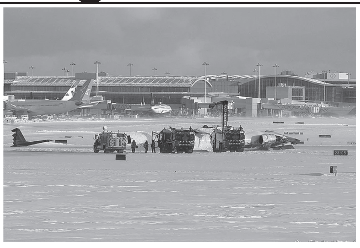
Pearson International Airport firefighters work on an upside down Delta Air Lines plane, which was heading from Minneapolis to Toronto when it crashed on the runway, in Toronto.

The report added that the bus fell into a chasm 800 meters (0.5 miles) deep. Among the injured are two children, who are in serious condition.