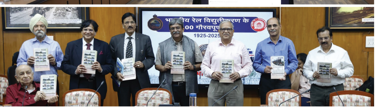
Glimpses of the Technical Seminar held at WR HQ

witnessed a momentous event—the debut of its first electric train on the current Indian Railways network. This inaugural journey, connecting Victoria Terminus to Kurla Harbour, marked a defining milestone, offering a glimpse into the limitless future of our nation's lifeline.