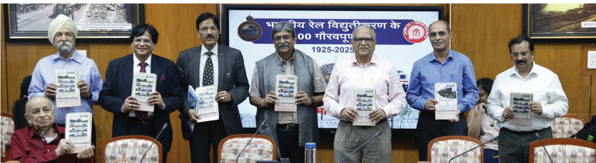
Glimpses of the Technical Seminar held at WR HQ.

witnessed a momentous event—the debut of its first electric train on the current Indian Railways network. This inaugural journey, connecting Victoria Terminus to Kurla Harbour, marked a defining milestone, offering a glimpse into the limitless future of our nation's lifeline.