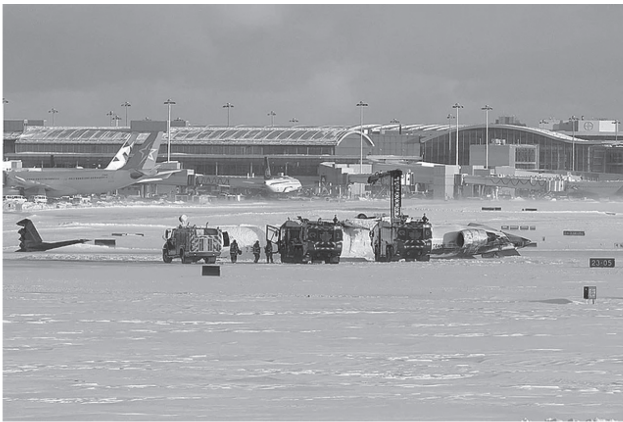
Pearson International Airport firefighters work on an upside down Delta Air Lines plane, which was heading from Minneapolis to Toronto when it crashed on the runway, in Toronto.

The report added that the bus fell into a chasm 800 meters (0.5 miles) deep. Among the injured are two children, who are in serious condition.