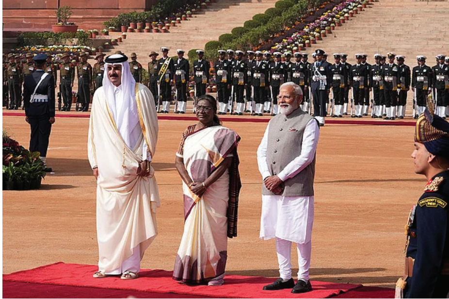
From left, Qatar's Emir Sheikh Tamim bin Hamad Al-Thani, Indian President Droupadi Murmu and Indian Prime Minister Narendra Modi pose for a photograph during the ceremonial reception of Emir at the Indian presidential palace in New Delhi.

New Delhi, Feb 18 (UNI) : Qatar committed to invest USD10 billion in India, and both sides agreed to double the bilateral trade by 2030, as both countries agreed to elevate their ties to a Strategic Partnership with focus on trade, energy and investments, following talks between Prime Minister Narendra Modi and Qatar Amir Sheikh Tamim Bin Hamad Al Thani here today.