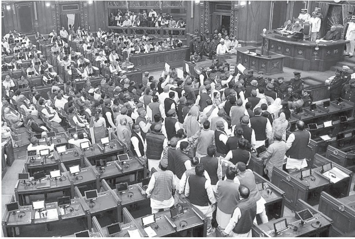
Samajwadi Party leaders protest during the joint sitting of both Houses addressed by Uttar Pradesh Governor Anandiben Patel, marking the beginning of the state Assembly budget session, in Lucknow.