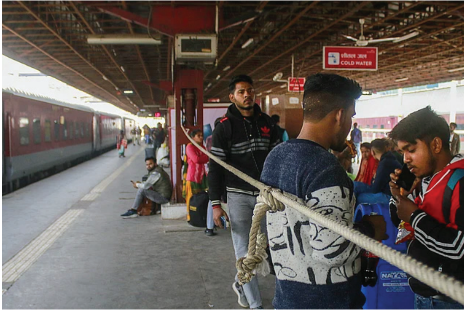
A rope is seen tied at a platform of the New Delhi Railway Station where a stampede occurred late Saturday night, in New Delhi.

New Delhi, Feb 16 (UNI) : The toll in the stampede at the New Delhi Railway Station has gone up to 18, with 12 others sustaining various degree of injuries, a hospital official said on Sunday. Five children and 11 women are among the dead, said the Chief Casualty Medical Officer at LNJP