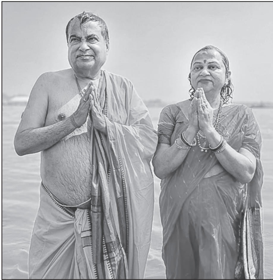
Union Minister Nitin Gadkari offers prayers with wife at Sangam after taking a holy dip during the ongoing 'Maha Kumbh Mela' festival, in Prayagraj, Uttar Pradesh.

Tewari said that what was even more troublesome was the continuing use of US military aircraft as if an attempt was being made to create a new normal with regard to eventual basing rights for the US military in India.