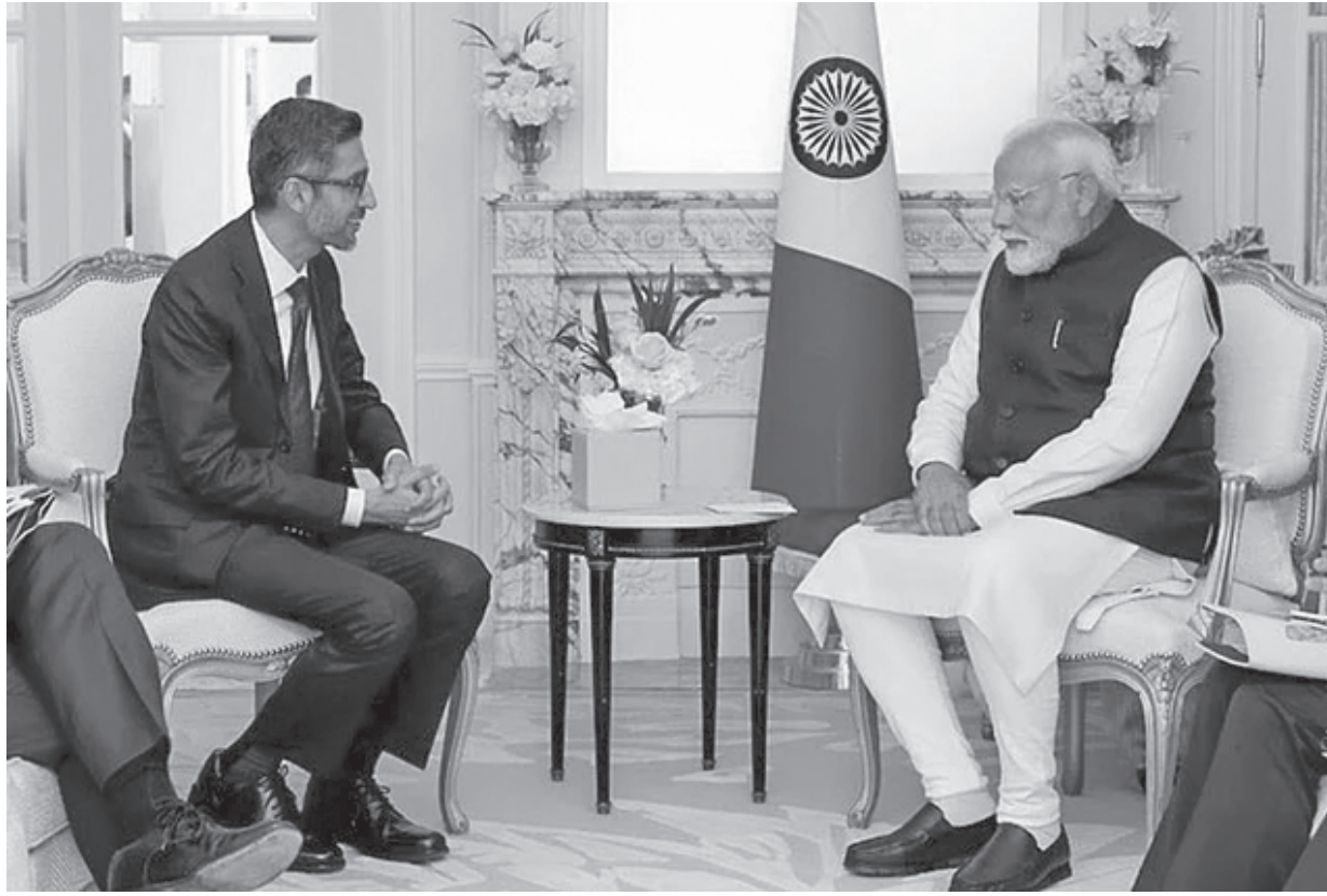
Prime Minister Narendra Modi meets Google CEO Sundar Pichai in Paris on Wednesday.

The statement also expressed Egypt's aspiration to cooperate with the United States to achieve "a comprehensive and just peace in the region by reaching a just settlement of the Palestinian cause that upholds the rights of the region's peoples."