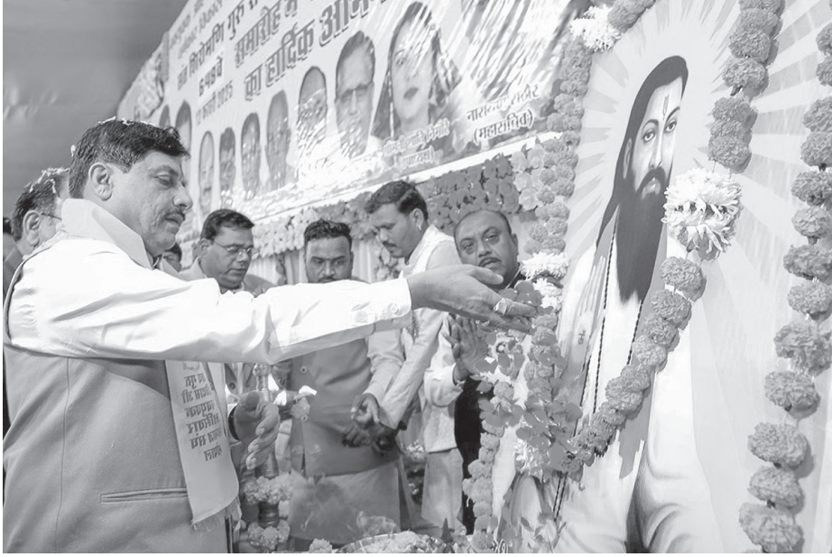
Madhya Pradesh Chief Minister Mohan Yadav pays obeisance on the Ravidas Jayanti, in Bhopal on Wednesday