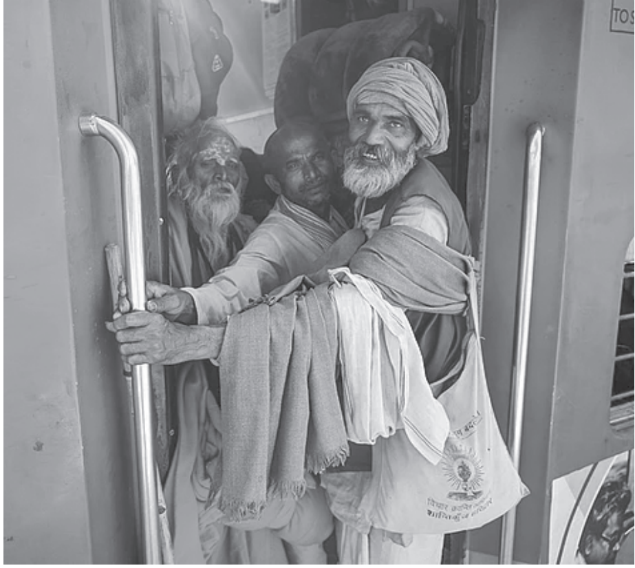
Devotees travel by an overcrowded train at Jhansi Railway Station amid a massive rush on Maghi Purnima during the Maha Kumbh Mela 2025, in Prayagraj on Wednesday.