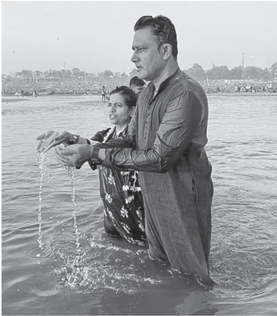
Former Indian cricket captain Anil Kumble prays after taking holy dip at the Sangam on Maghi Purnima, during the ongoing Maha Kumbh Mela 2025, in Prayagraj on Wednesday.