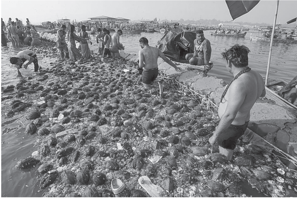
Coconuts and other material used for prayers and rituals accumulate along a floating jetty at Sangam, on the occasion of Maghi Purnima during the ongoing 'Maha Kumbh Mela', in Prayagraj on Wednesday.