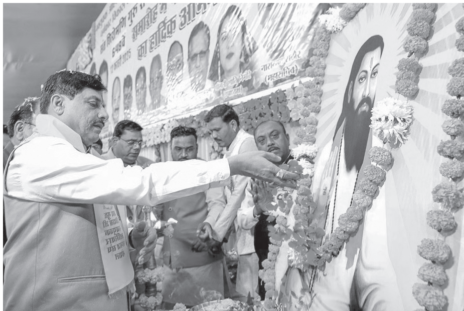
Madhya Pradesh Chief Minister Mohan Yadav pays obeisance on the Ravidas Jayanti, in Bhopal on Wednesday