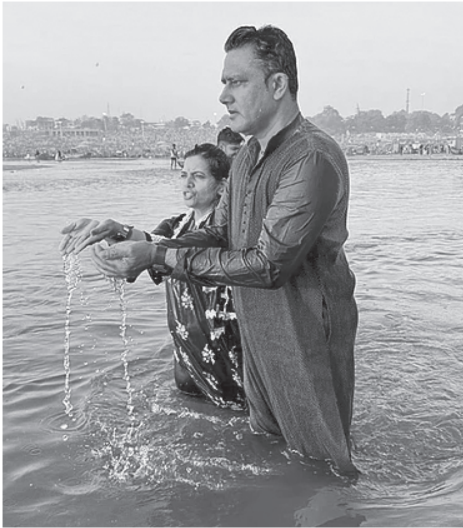
Former Indian cricket captain Anil Kumble prays at taking holy dip at the Sangam on Maghi Purnima, during the ongoing Maha Kumbh Mela 2025, in Prayagraj on Wednesday.